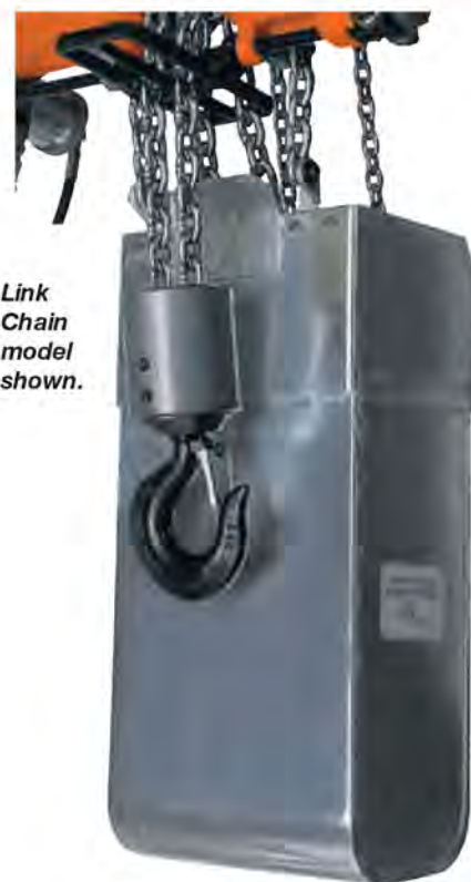
Link Chain model shown.